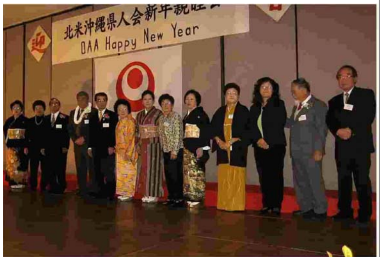
The OAA New Year's Party and New officers Installation